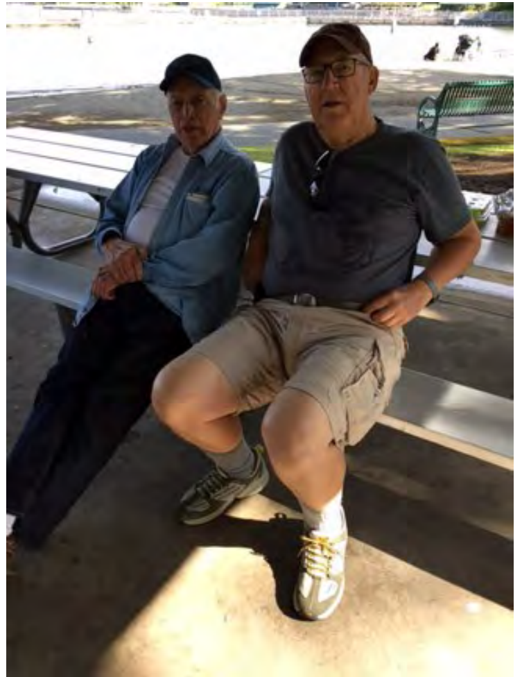
Bench Warming by Vaughn & Hoople